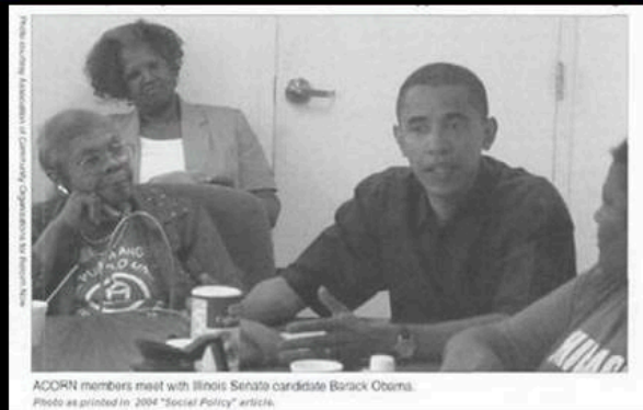
ACORN members meet with Illinois Senate candidate Barack Obama. Photo as printed in 2004 "Social Policy" article.

Gamaliel Foundation Obama's only job prior to Illinois Senate run. Soros funded and ties with (IAF) Industrial Area Foundation founded in 1939 by Saul Alinsky.