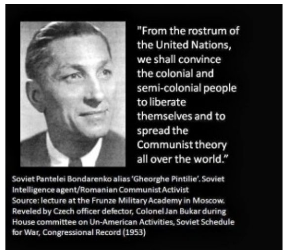
Pantalei Bondarenko alias Gheorghe Pintilie Double Soviet Spy

The "League of Nations" preceded "United Nations" but lack of participation League of Nations collapsed. Both shared the same "End State" of Global Control using Communism as it's strategy to achieve a "Palestinian State".