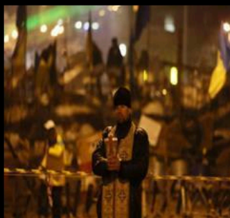
3/2013 "Unification of Svoboda with other opposition forces is not funny but dangerous" Prime Minister Mykola Azarov