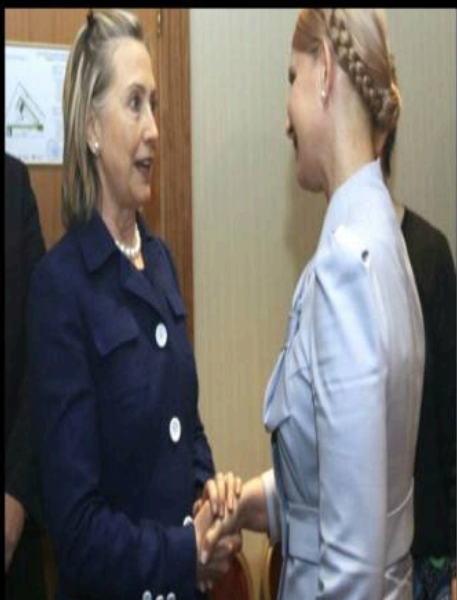
Hillary Clinton Praises Viciously Anti-Semitic Ukrainian Neo-Nazi Leader Secretary of State Hillary Clinton and Ukrainian neo-Nazi leader Yulia Tymoshenko at a reception held in Kiev in 2010.