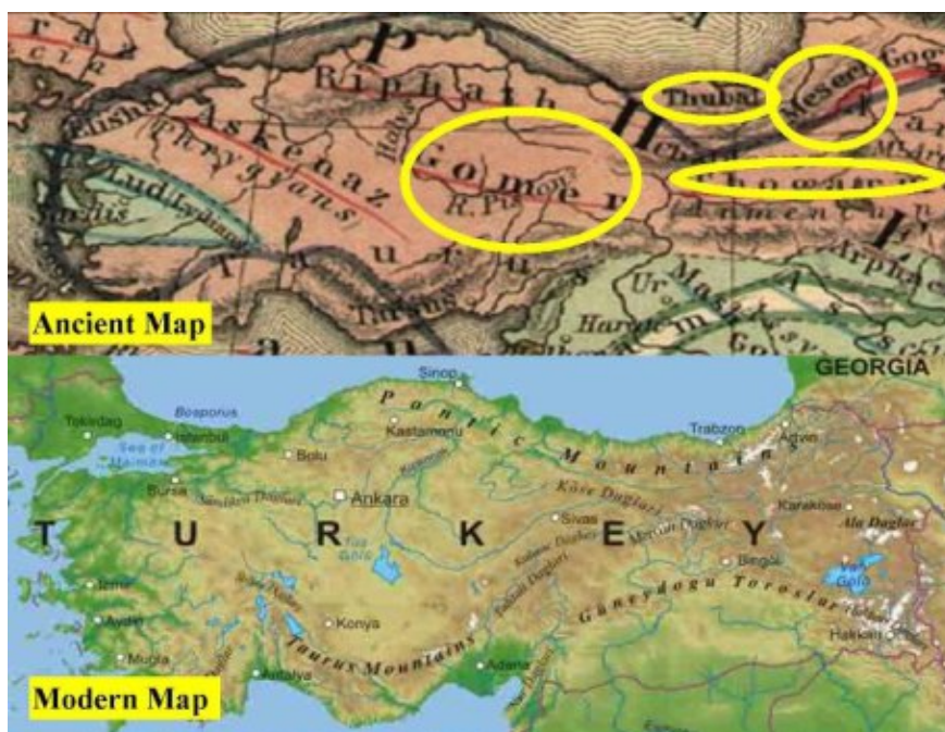
Meshech and Tubal is Modern Turkey King of The North

Is Isaiah 18 prophecy for Ethiopia Modern Day Africa? What was Nimrod Noah’s great-grandson role in Tower of Babel? Noah’s son was “Ham” which was cursed for obvious reason. Ham father of Canaan father of Cush father of Nimrod which translates into “Let us Rebel”. There are many prophecies concerning Ethiopia most of modern day Africa. Bible prophecy of Ezekiel 38 states Ethiopia will aid Turkey in invasion against Israel.