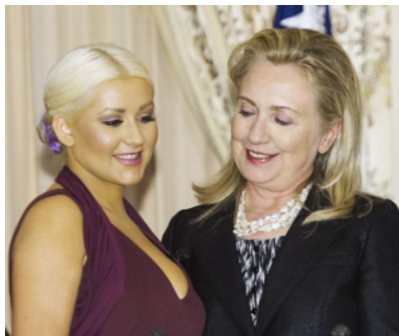
Christina Aguilera chats Hillary Clinton eyeing her cleavage

POST MARXISM GOAL OF CULTURAL HEGEMONY OLIGARCHY.