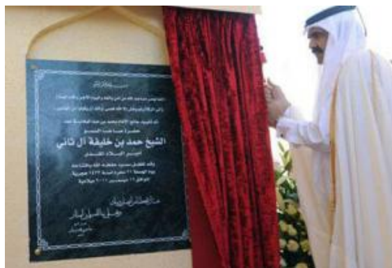
Qatari Emir inaugurates ‘Imam Muhammad Ibn Abdul Wahhab’ Mosque in Doha,

12/2011 Qatari Emir inaugurates ‘Imam Muhammad Ibn Abdul Wahhab’ Mosque in Doha, vows to spread ‘teachings of Islam in whole world’ .