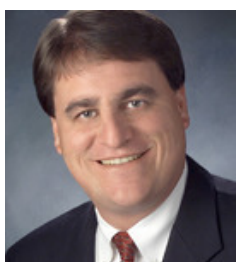
Fort Lauderdale Mayor Jack

Fascism is a form of government, in which the country is considered more important than any one person, group, liberty, or provision. A country under this kind of government is usually run by a person called a leader, who has the right of total control over the government and people. Fascist leadership might also be similar to an oligarchy , such as in Italy where the fascist party was ruled by its "grand council" from 1922 until the end of World War Two.