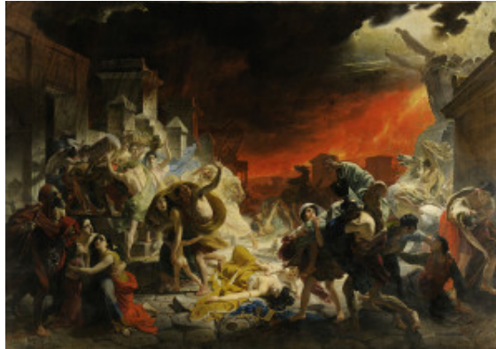
The Last Day of Pompeii Sex Capitol of The World destroyed within hours Eruption of Mount Vesuvius in 79 A.D.

Due to this unprecedented persecution , the Christians believed that their generation would be the final one before the end of the world. The great Apostle Paul , who established Christianity at Rome, was beheaded outside the city by order of Nero.