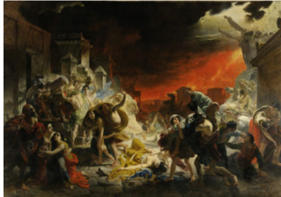
The Last Day of Pompeii Sex Capitol of The World destroyed within hours Eruption of Mount Vesuvius in 79 A.D.

Due to this unprecedented persecution , the Christians believed that their generation would be the final one before the end of the world. The great Apostle Paul , who established Christianity at Rome, was beheaded outside the city by order of Nero.