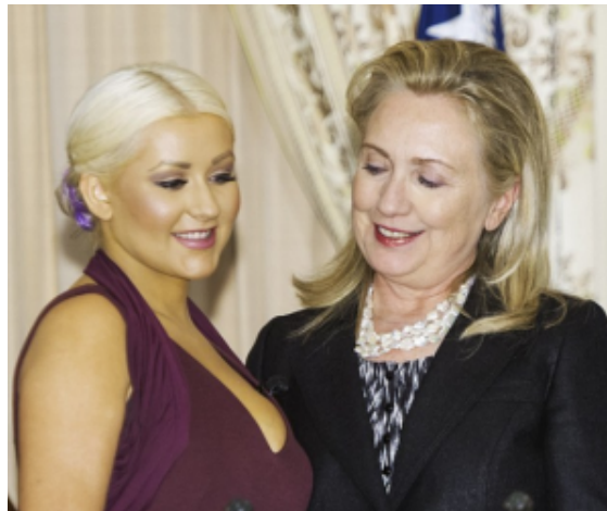
Christina Aguilera chats Hilary Clinton eyeing her cleavage

Christina Aguilera catches Hillary Clinton eyeing