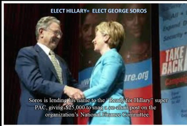
Soros is lending his name to the “Ready for Hillary” super PAC, giving $25,000 to snag a co-chair post on the organization’s National Finance Committee.

“Our country needs us and we need people like George Soros, who is fearless and willing to step up when it counts” ~ Hillary Clinton