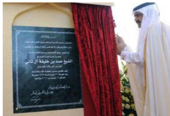
Qatari Emir inaugurates ‘Imam Muhammad Ibn Abdul Wahhab’ Mosque in Doha,

12/2011 Qatari Emir inaugurates ‘Imam Muhammad Ibn Abdul Wahhab’ Mosque in Doha, vows to spread ‘teachings of Islam in whole world’ .